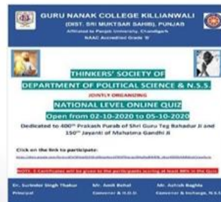
National Level Online Quiz on the life of Shri Guru Teg Bahadur Ji and Mahatma Gandhi Ji jointly organized by Deptt. of Political Science and NSS from 02-Oct.- 05-Oct. 2020