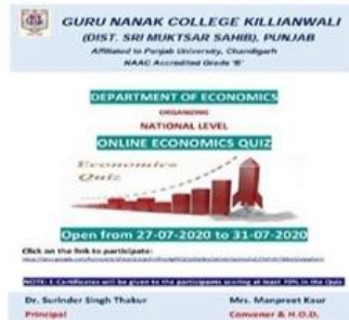
National Level Online Economics Quiz organized by Deptt. of Economics from 27-07-2020 to 31-07-2020