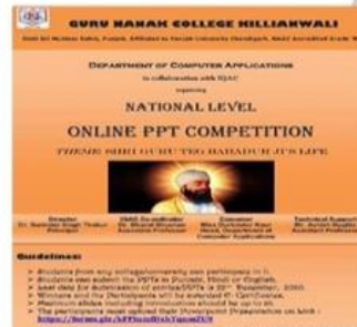
National Level Online PPT Competition on Shri Guru Teg Bahadur Ji's life organized by Deptt. of Computer Applications from 15-Dec. to 22-Dec. 2020